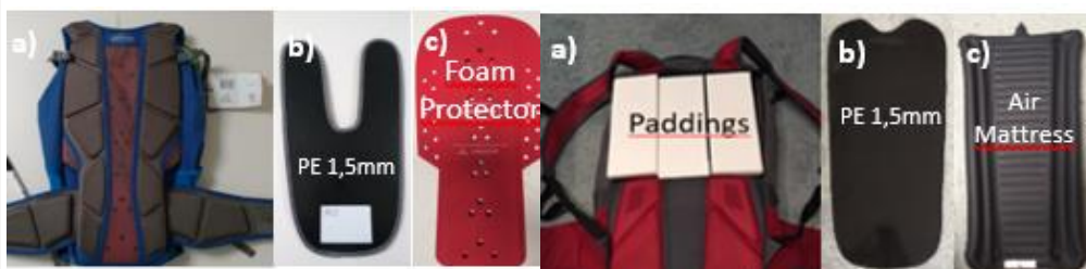
Fig. 2: Left: a) Moab Pro 22L; b) 1,5 mm thick polyethylene plate; c) Ortema foam protector (2 cm thick, weight 395 g and 50 Asker C). Right: a) Bracket 22 L with 10, 20 mm thick EVA foam paddings (20 Asker C); b) 1,5 mm thick polyethylene plate (PE); c) inflatable air mattress (3 cm thick, weight 200 g)

A conventional FPS (Moab Pro 22L, VAUDE Sport GmbH) and an APS (consisting of an inflatable air mattress within the Bracket 22L, VAUDE Sport GmbH) (Figure 2) was used for the investigation. Ethylene-vinyl-acetat (EVA) paddings with a hardness of 20 Asker C in two different thicknesses (10 and 20 mm) were also used (Figure 2, right a).