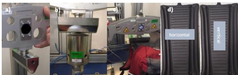
Fig. 1: a) Drop test device according to EN 1621-2; b) test block (steel anvil) including load cell sensor; c) positioning of the backpack in between the test apparatus; d) Drop body alignment during impact - horizontal and vertical.

Accordingly, to the EN 1621-2 (standard for motorcycles), the experiments were carried out with a prescribed impactor with a drop mass of 5kg, predefined rectangular dimensions and a free-falling impact (ad Engineering, Typ 1011MAU 1002/2W/ALU/SF), which resulted in an impact of 50J kinetic energy (Figure 1). The distance between the drop mass and the sample was 100cm (drop height). Impacts with a horizontal as well as a vertical alignment of the test body were applied. This deviation from the EN 1621-2 was conducted to get an overview of the protective performance in several different backpack conditions. The standard includes two different safety levels (safety level 1: average RIF of <18kN; safety level 2: average RIF <9kN).